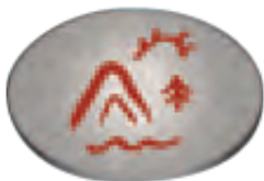
Íwseltnéws- Everything is interelated

We have a vision of a Secwépemc-speaking community living in balance with nature.