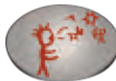
Mellélc Take time to regenerate