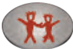
Knucwestsút.s- Help yourself