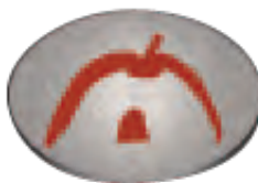
Qweqwetsin- Humble yourself to all creation