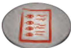
Sléxléxs- Develop Wisdom